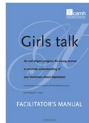
Girls Talk Program