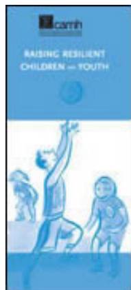
Raising Resilient Children