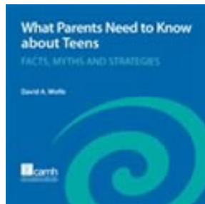
What Parents Need to Know about Teens